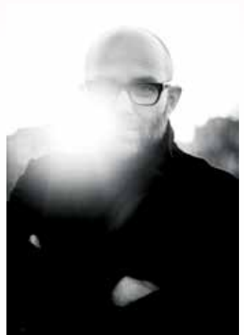
Sølve Sundsbø © Anne Vesaas