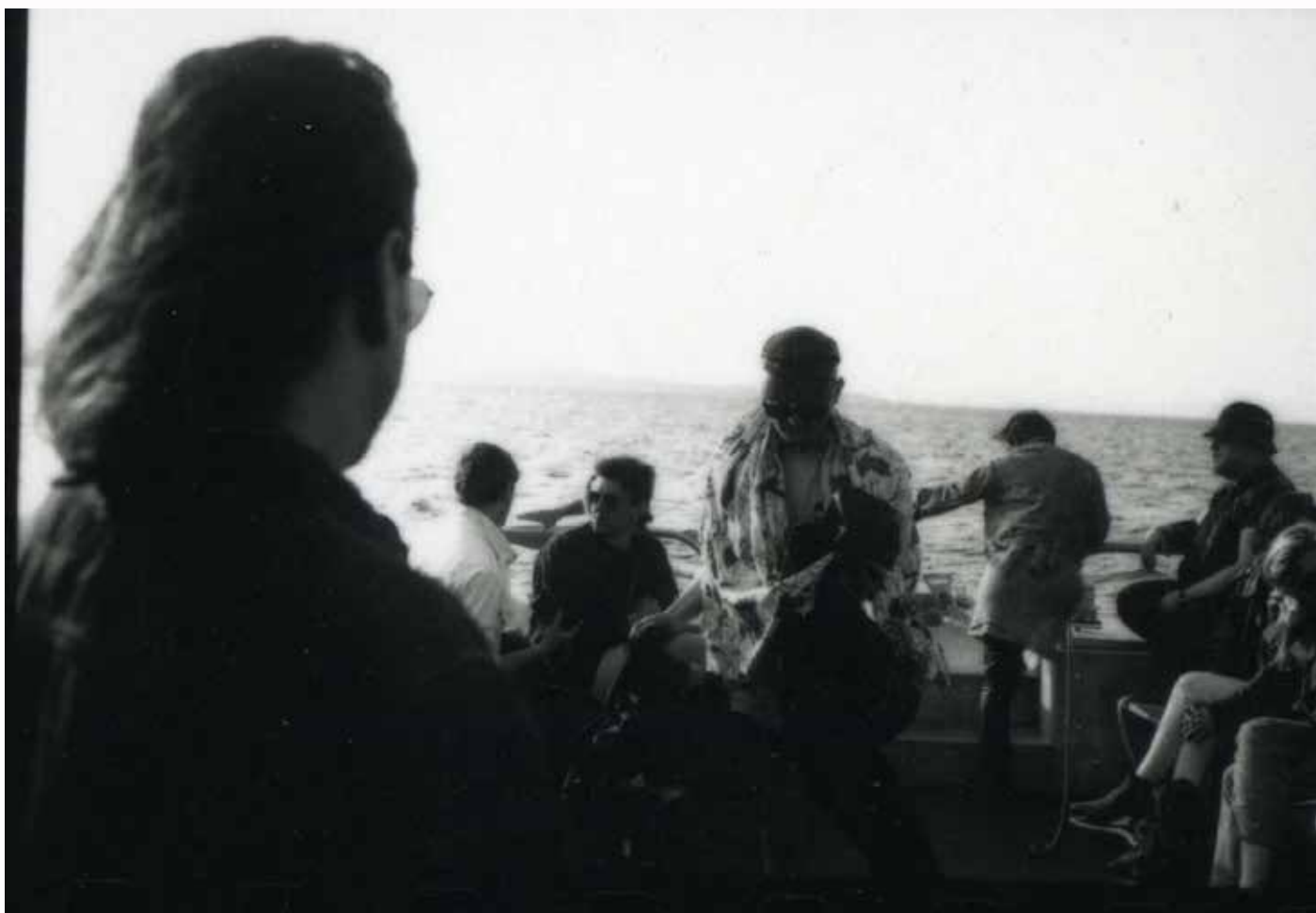
The jury chaired by Helmut Lang, with Jean Colonna, Martin Margiela, and Jean Touitou on the boat to Porquerolles, 1992