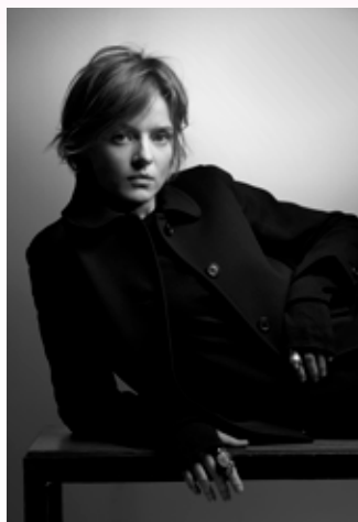
Priscilla Royer © Karl Lagerfeld