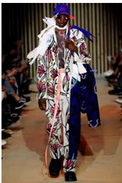
BOTTER, winners in 2018