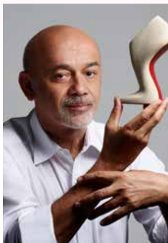
Christian Louboutin