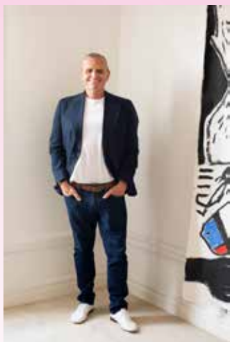
Jean-Charles de Castelbajac ©JOSEPHINE DAY