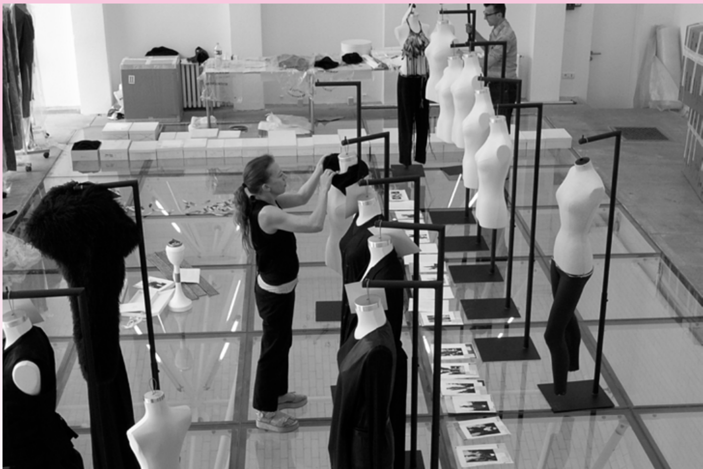
Ann Demeulemeester, Jury President, setting up her exhibition in the villa Noailles pool, 2006