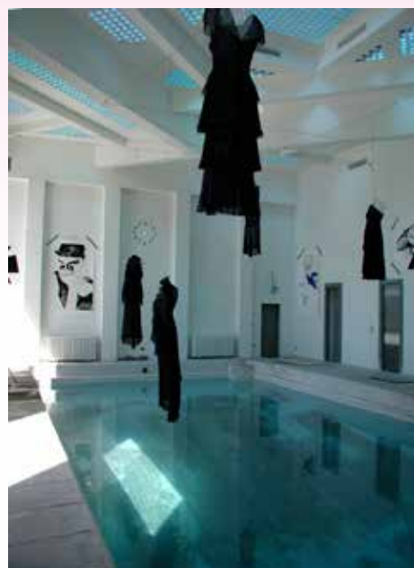
Exhibition by Karl Lagerfeld, Jury President, in the villa Noailles pool, 2002