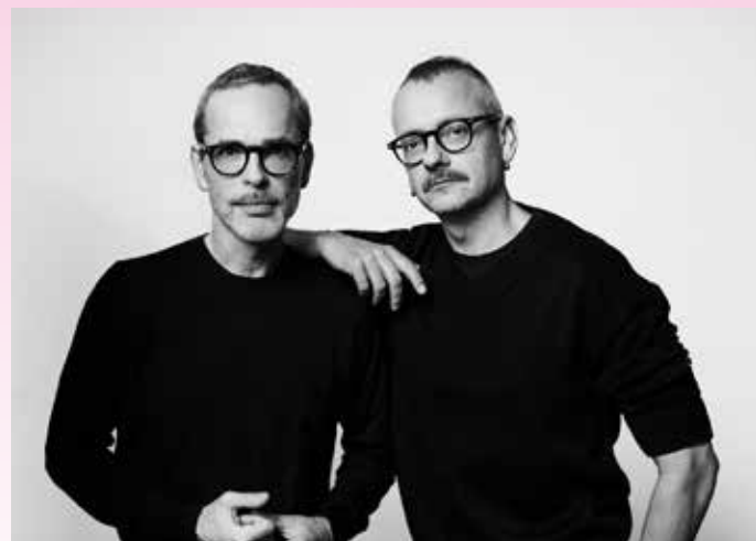
Viktor Horsting et Rolf Snoeren