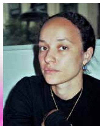
Grace Wales Bonner