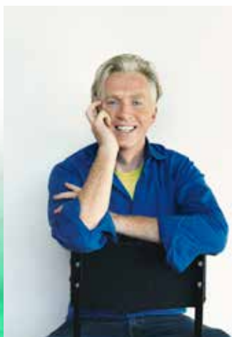
Philip Treacy